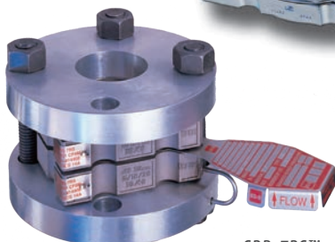
SRB-7RS™ safety head installed between companion flange